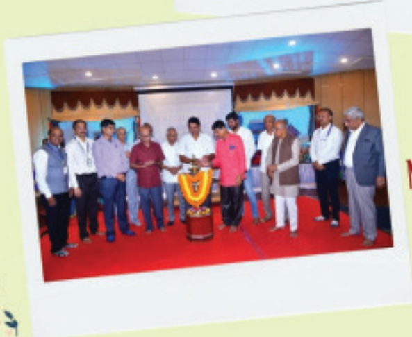
MALENADU MELA 2022