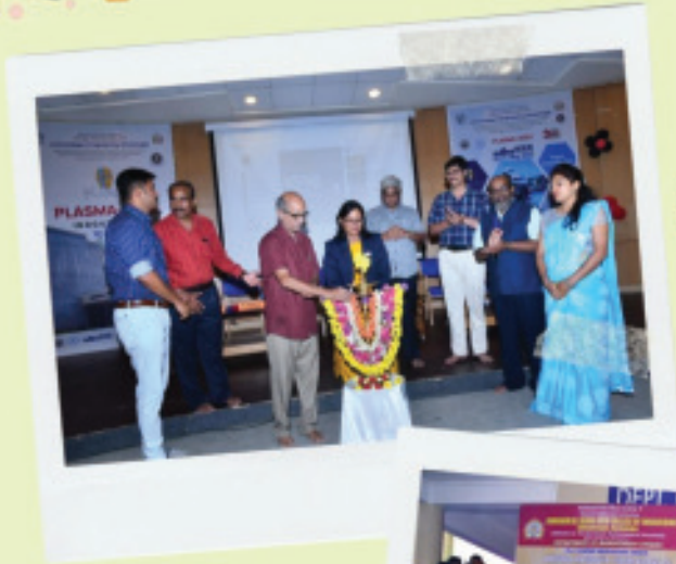
INAUGURATION OF PLASMA - 2K22